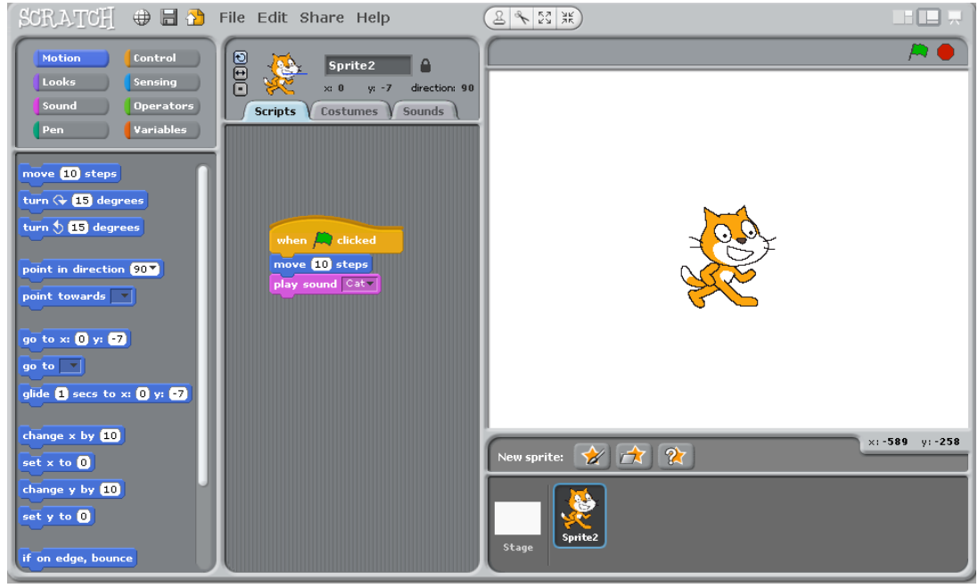
Fig. 2 – Scratch programming environment

In this context, appeared the Scratch application (Fig. 2), which is based on programming languages like Logo and Squeak, and it allows, especially children and teenagers, to create and share interactive stories, games, music and web animations, profiting from the participatory spirit of Web 2.0.