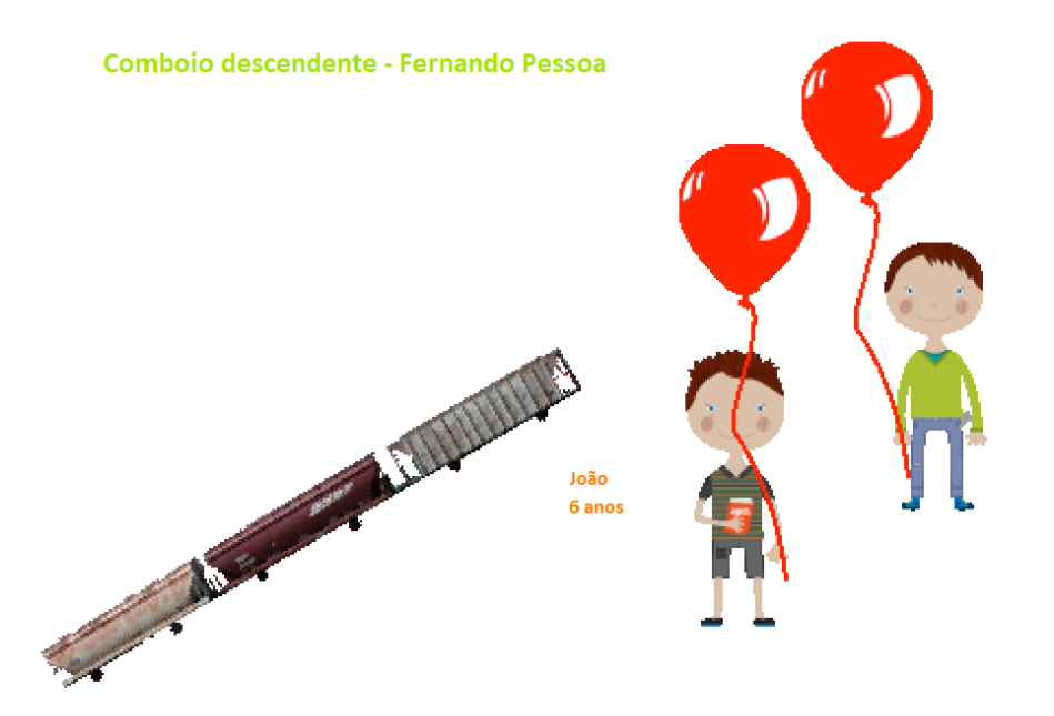
Fig. 5 – Scratch representation of the poem "Comboio Descendente" by Fernando Pessoa

On this day, it was also possible make a session in which children shared with their parents what they have learned during these two months of "Childhood with Scratch in motion", teaching them the basic concepts of the Scratch programming. In addition, were presented to parents the main functionalities of Scratch and how to download the application at kids.sapo.pt.