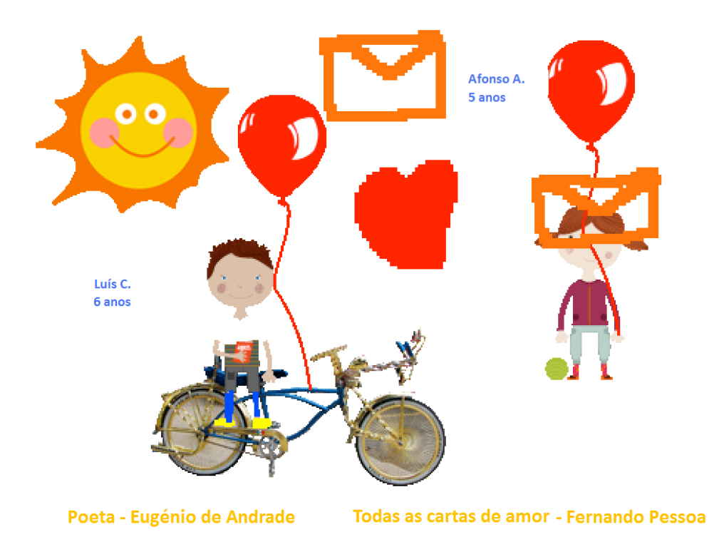
Fig. 6 – Scratch representation of the poems "Poeta" by Eugénio de Andrade and "Todas as cartas de amor" by Fernando Pessoa